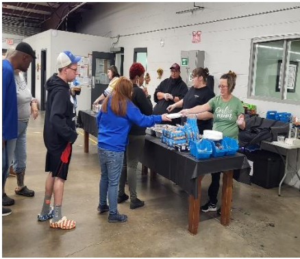
At the end of November, we celebrated Thanksgiving with one another.